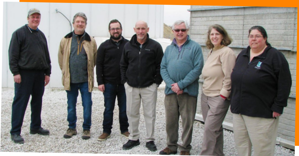
(Pictured Right) Quasar Energy Facility Tour (2020)

Read more about the group here: https://urban.csuohio.edu/news/cpnms-environmental-mentoring-team-inspires-students-through-collaborative-effort