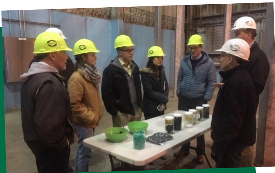
(Pictured Left) Akron Recycling Facility Tour (2018)